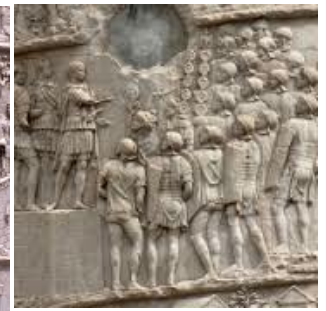
This plaster-cast shows how it might have originally looked. This section has the god Jupiter joining the fighting at the top right.